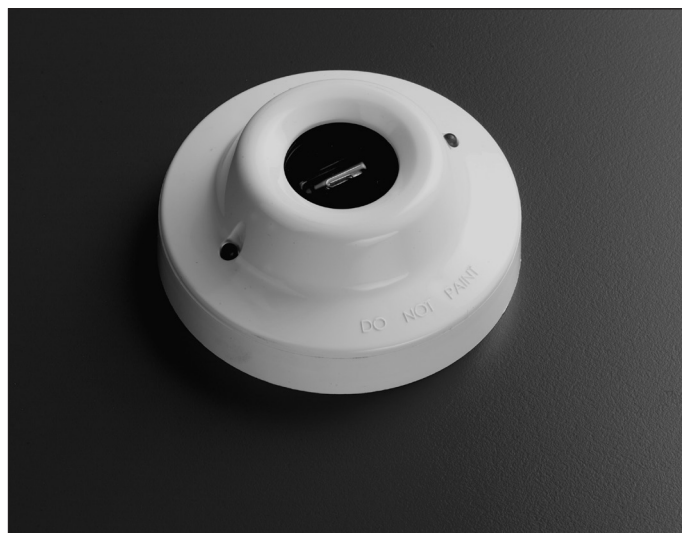
Part no. 55000-026MAR

The alarm current also illuminates the detector's integral LEDs. A remote indicator connected between the L1 IN terminal and the -R terminal will have a voltage equal to the supply voltage less 1V across it and so will illuminate.